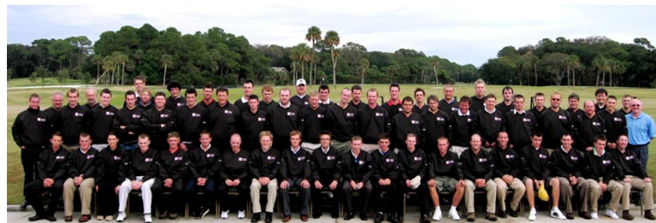
Global Turf Interns gather for a group photograph with the President of the GCSAA (in the white hat) This could be you if you apply.

Do you want to be successful in Golf Course Management ? Have an American experience!